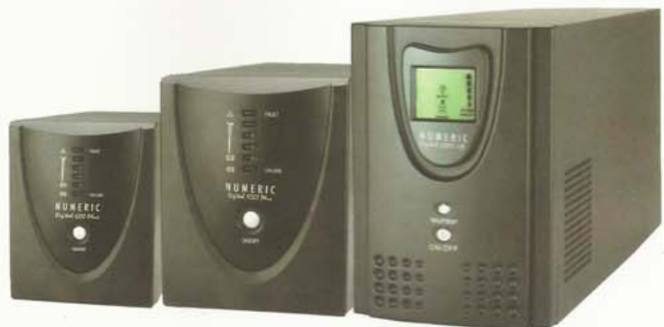
Digital LI Series 600 VA - 2 kVA

The Digital LI Series delivers quality power to protect the loads, and functions with a high electrical efficiency. With its superior performance the Digital LI Series stands far above the contemporary UPS systems.